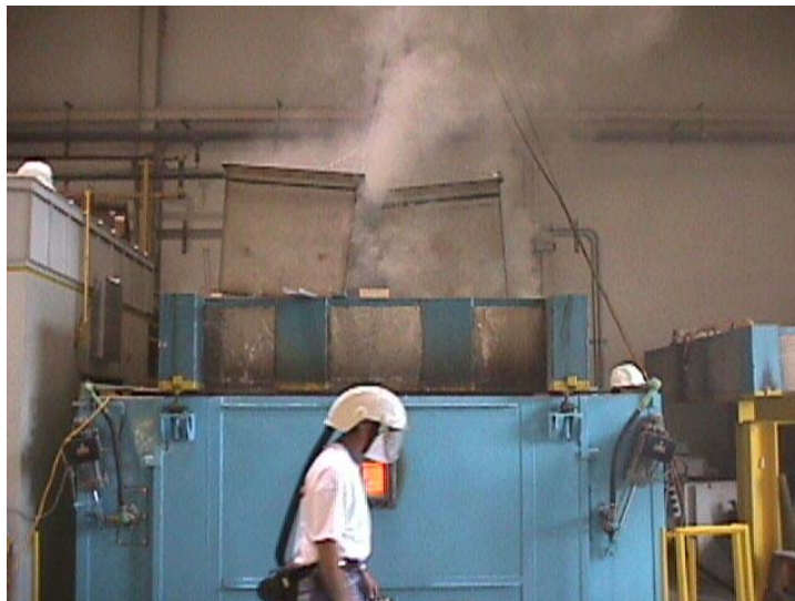
Fire Protected I-joisted Floor under ASTM E-119 Test Note Water Containers Leaning Inward Due to Floor Sag

Firefighters should be aware that while floor sag may be a widely accepted warning of an impending structural failure, floor sag is not always present or visible prior to catastrophic collapse in a fire, regardless of the joist type, due to the fire's intensity, the combination of joist spans and loads present, the location of serious structural fire damage or simply because it is too dark and/or smoky to see a sag in the floor. This is true for all types of structural joists, including combustible such as sawn lumber, wood I-joists, and open web wood trusses and noncombustible members such as lightweight steel joists.