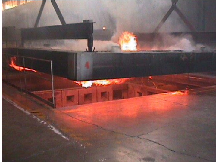
Removing Full-Size I-Joisted Floor Assembly from the furnace after the ASTM E 119 Test